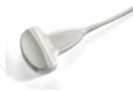
Convex array: PB-C361-2

All probes are lightweight and ergonomically designed to deliver premium performance and user comfort in Abdominal, Vascular, Small Parts, Musculoskeletal, Obstetrics and Gynecology applications.