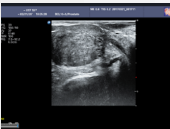
Prostate Linear Scanning Biplane Probe